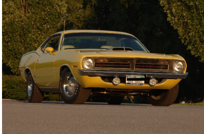
One of the many great professional shots of this beautiful 'Cuda!

OPEN HOUSE 2007- The RJ CARS crew was blessed again with great weather for the Open House Event held July 28, 2007. We welcomed