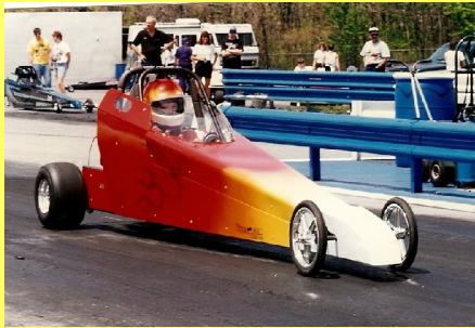
Mini Dragster Owned by Markle Racing