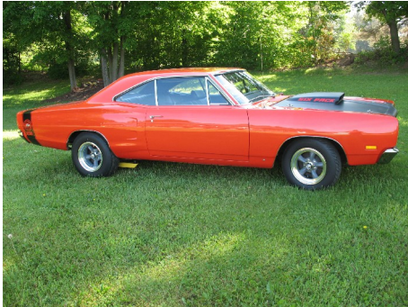
69 Dodge Super Bee