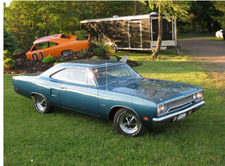
70 Plymouth Satellite