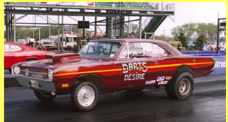
"Darts Desire" Owned/operated by CJ Tremper