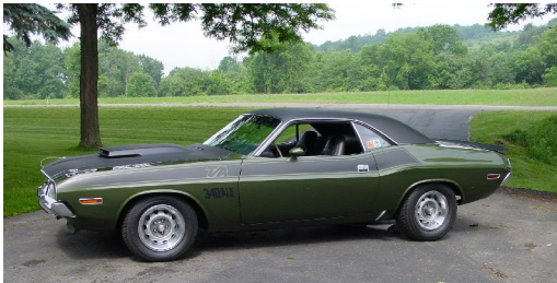
70 Dodge Challenger T/A