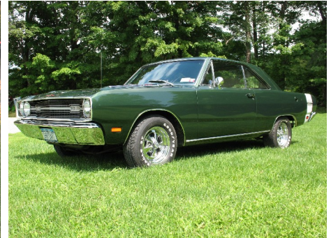
69 Dodge Dart GTS