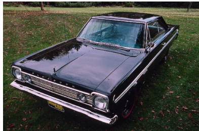
66 Plymouth Belvedere II