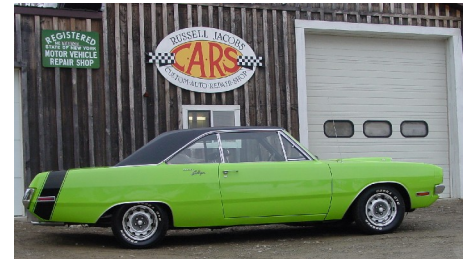
70 Dodge Dart Swinger