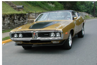
72 Charger Rallye Coupe