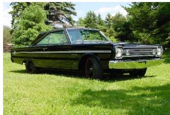
66 Belvedere II