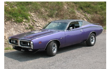
71 Super Bee

Pictured above are a few of the cars that have gone to Carlisle with us over the years. We would like to once again thank the owners for so graciously allowing us to display their most prized possessions. Stop by and see us this year! We are located in row N89-94.