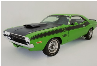
70 Challenger T/A