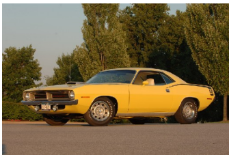
70 Plymouth 'Cuda