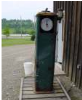
Vintage "Flying A" Gas Pump Made by Gilbert & Barker "1920-30's"