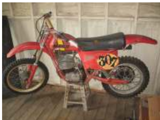
1978 Maico Magnum 250

Remember to catch us at the Carlisle All-Chrysler Nationals on July 9-11th.