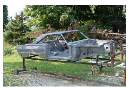
1966 Hemi Coronet receiving a Rotisserie Restoration.