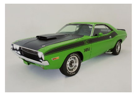
1970 T/A Challenger after receiving a Rotisserie Restoration.