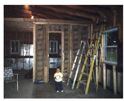
The new office area under construction

As some of you may know RJ CARS is currently undergoing some major renovations.