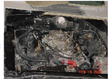
1966 Plymouth Belvedere II, 426 Hemi