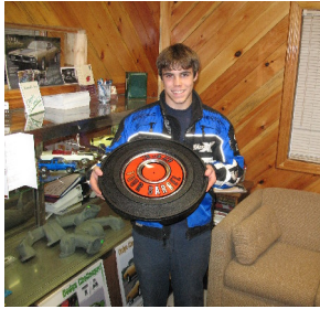
"My freshly restored air cleaner"

Next up for the Dart project is getting it on Matt's freshly built rotisserie and getting it sandblasted and into primer. Matt is in the process of putting together the necessary steel and hardware to build the rotisserie. This should be completed over the next couple months. Matt is finding out first hand how much time and effort goes into restoring an old rusty car from the ground up. Good thing the kids got natural talent (not to mention Dad's resto shop in the back yard!)