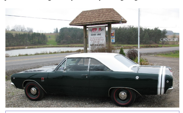
'68 Dart w/Hemi 4 speed

Jamie Furman's 1968 Hemi Dart is undergoing a partial restoration that includes mechanical work (rebuilding the 4 speed transmission, shifter and linkages, replacing the manual steering box and installing a new TTI exhaust) We're also stripping the exterior body to bare metal and re-working it for a beautiful new paint job with new glass, weather-stripping, and polished trim to put the "icing on the cake"! The Hemi in this Dart has presented some unique challenges in regards to working space in the engine bay, but boy, is it going to be fun!