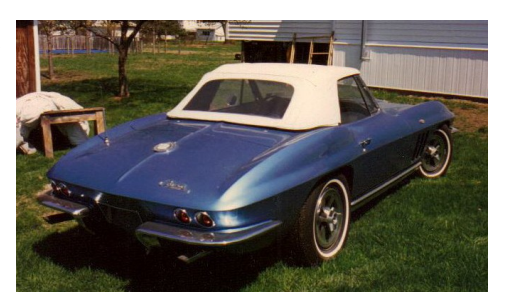
Next Project: Our 1965 Corvette (owned since 1970)