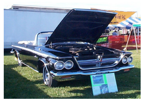
Original/un-restored 64 Chrysler 300 Convertible 3 Speed Stick