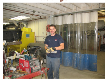
And they still smile!