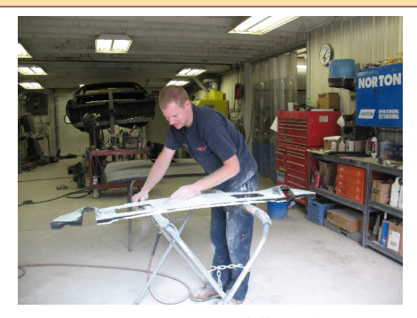
The endless hours of Sanding...