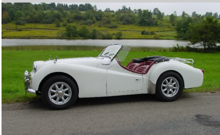
1961 TRIUMPH TR3A