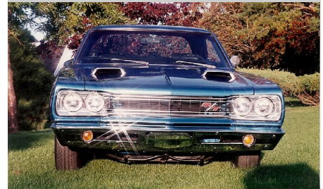
1969 DODGE CORONET R/ T