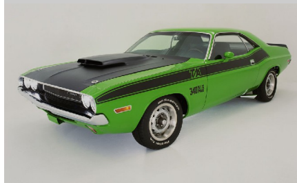
1970 DODGE CHALLENGER T/ A