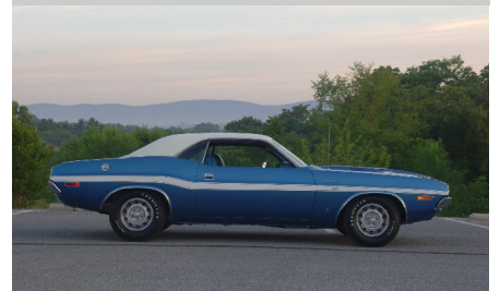
1970 DODGE CHALLENGER R/T