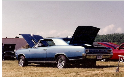
1966 CHEVELLE SS