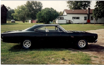
1968 DODGE CORONET R/ T

Hours: 8:30am - 5:30pm Monday - Friday Saturday by Appointment