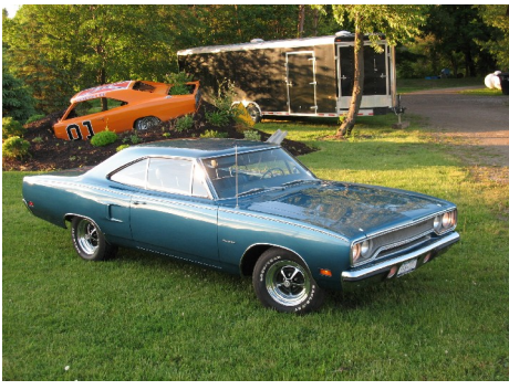
70 Plymouth Satellite Owner-Richard Argentieri-Hornell, NY