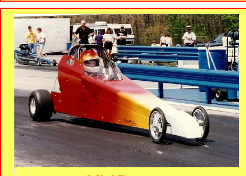
Mini Dragster Owned by Markle Racing