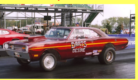
"Darts Desire" Owned/operated by CJ Tremper