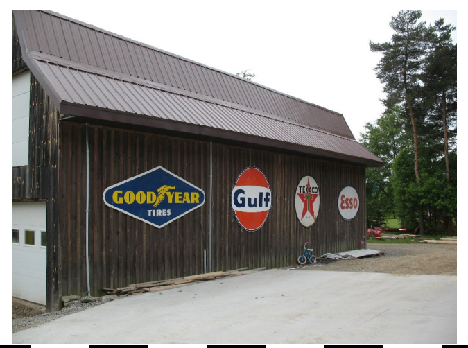
ing and siding are replacing some of the weathered shingles and barn boards. Some vintage service station signs were a nice touch added to the rear of the barn!

The poles are set for the paint shop addition and the trusses are in production. Soon we'll be giving the whole front area of the shop a face lift. New metal roof-