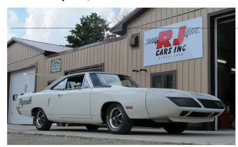
Quality Automotive Repair and Restoration Services

1789 County Route 50 Arkport, New York 14807