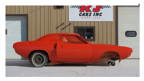
For the most up to date project photos - visit www.rjcars.com and click on photo gallery!

1789 County Route 50 Arkport, New York 14807