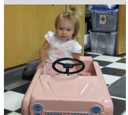
They are the future for American Muscle Cars!

Much of this issue displays a few of the Dodge Challengers we've done and one 1970 model that we're currently working on. 2015 will be the 45th anniversary for the Dodge Challenger and the Ebody Plymouth Cuda as well. I remember these cars from my childhood when the 'right thing to do' was add air shocks, shackles, and big bias ply tires to the back of every car and you had yourself an instant Hot Rod! Well, that's changed quite a bit since the 70s and you rarely see one out there set up like that anymore... probably since they really didn't handle that well with those mods! I still miss all the cool cars that we took for granted back then. Many of them are now rotted away or were wrecked beyond repair years ago.