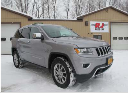
Keep RJ Cars in mind for those little or maybe not so little repairs! We work with many insurance companies and would be happy to give you an estimate on any necessary repairs!