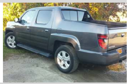
"We are very happy with the work you guys did. It's nice to have it back looking as good as new. We really appreciate you getting it done so well and so quickly."