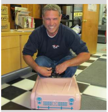
...but that doesn't mean my playtime is!