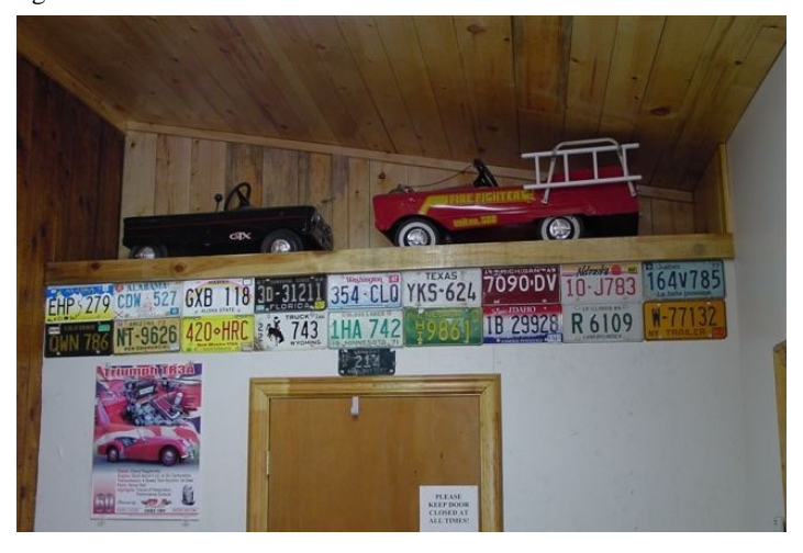
RJ CARS, INC. "Plated" Wall Thanks to our readers we have a lot more to put up on the wall! Also note:

Cheryl's Triumph TR3A Show Board (previous issue) - lookin' good!