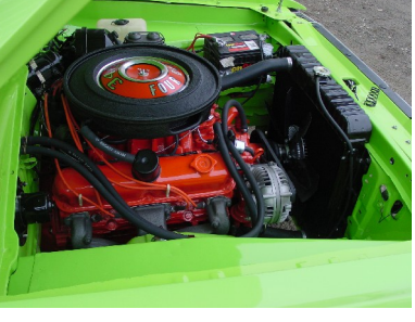
Engine bay after Restoration ishing touch was installing the characteristic rear black stripe to

engine, transmission, and front suspension. We also removed the seats and replaced the carpet in this SubLime green Dart. We repainted and detailed the engine bay and under hood components. The fin-