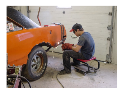
Chop, cut, rebuild!