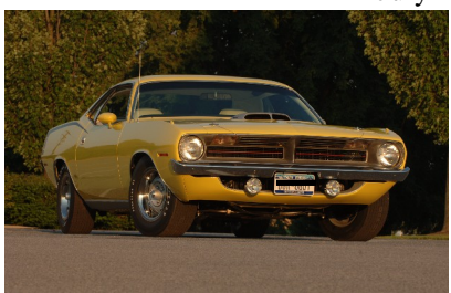
One of the many great professional shots of this beautiful 'Cuda!

at the RJ CARS tent for Car- RJ CARS crew was blessed lisle 2008, but you should all make plans to stop out and see us!