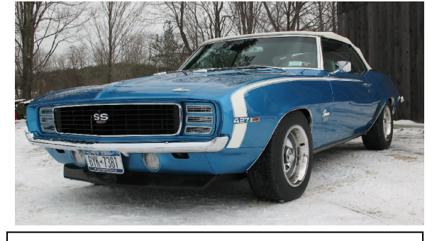
All it needs is a nice set of winter re-caps and it's good to go!!