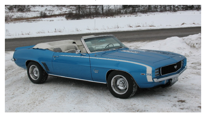
Ready for delivery January 2008

over one too many times Lemans blue with white interior. His car started life as a SS- 350 with an automatic transmission. Now we have