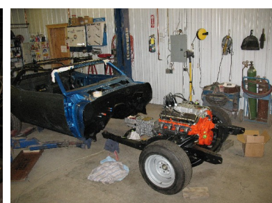
Let the assembly begin!