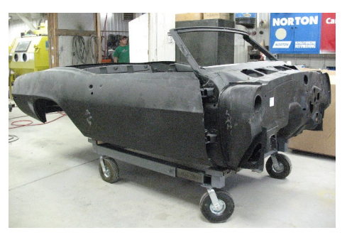
Body by Dynacorn