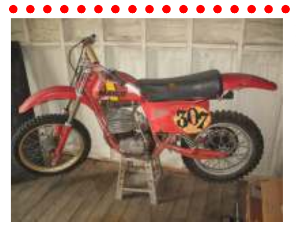
1978 Maico Magnum 250

Remember to catch us at the Carlisle All-Chrysler Nationals on July 9-11th.