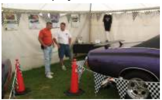
JOIN US AT CARLISLE

"A MOPAR lover's paradise with attendees converging on the fairgrounds from all over the world. This weekend-long event crosses all eras of the Chrysler marque from classic to muscle to everything in between."