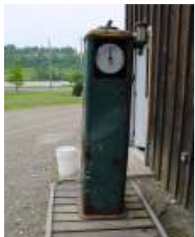
Vintage "Flying A" Gas Pump Made by Gilbert & Barker "1920-30's"