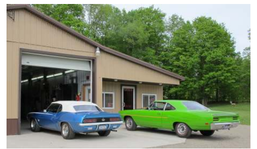
For the most up to date project photos-visit www.rjcars.com and click on photo gallery!