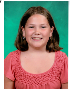
5th Grade—Age 10