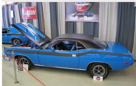
72 'Cuda Owner: Tom Terry III