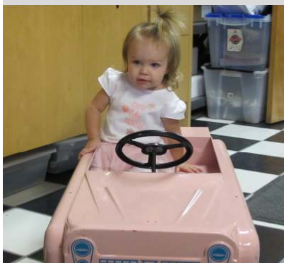
They are the future for American Muscle Cars!

Much of this issue displays a few of the Dodge Challengers we've done and one 1970 model that we're currently working on. 2015 will be the 45th anniversary for the Dodge Challenger and the Ebody Plymouth Cuda as well. I remember these cars from my childhood when the "right thing to do" was add air shocks, shackles, and big bias ply tires to the back of every car and you had yourself an instant Hot Rod! Well, that's changed quite a bit since the 70s and you rarely see one out there set up like that anymore... probably since they really didn't handle that well with those mods! I still miss all the cool cars that we took for granted back then. Many of them are now rotted away or were wrecked beyond repair years ago.