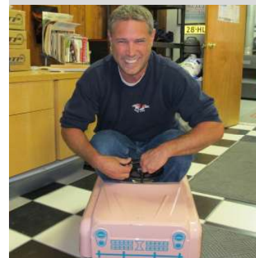
...but that doesn't mean my playtime is!