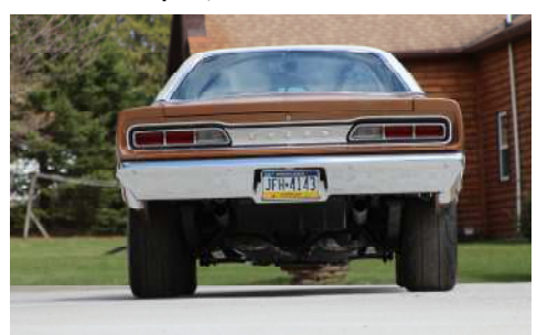
For the most up to date project photos - visit www.rjcars.com and click on photo gallery!

1789 County Route 50 Arkport, New York 14807